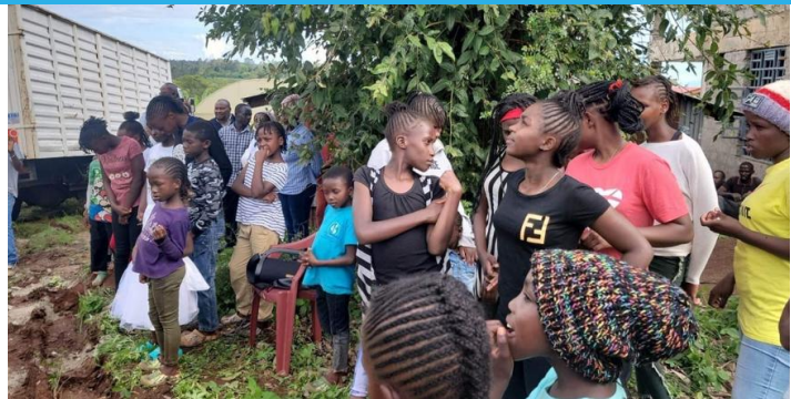
EARLY STAGES OF THE UPENDO KIDS VILLAGE PROJECT