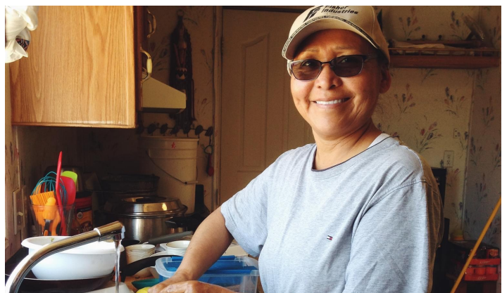
FAMILIES ON THE NAVAJO NATION